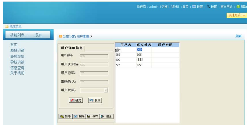
Fig.2 Operation diagram

According to the relevant process operation, the user can know the operation process of the user management function. According to the actual operation situation, the corresponding operation setting can be completed, so that the user can perform the function operation on the page, thus ensuring the integrity of the entire logistics information management system.